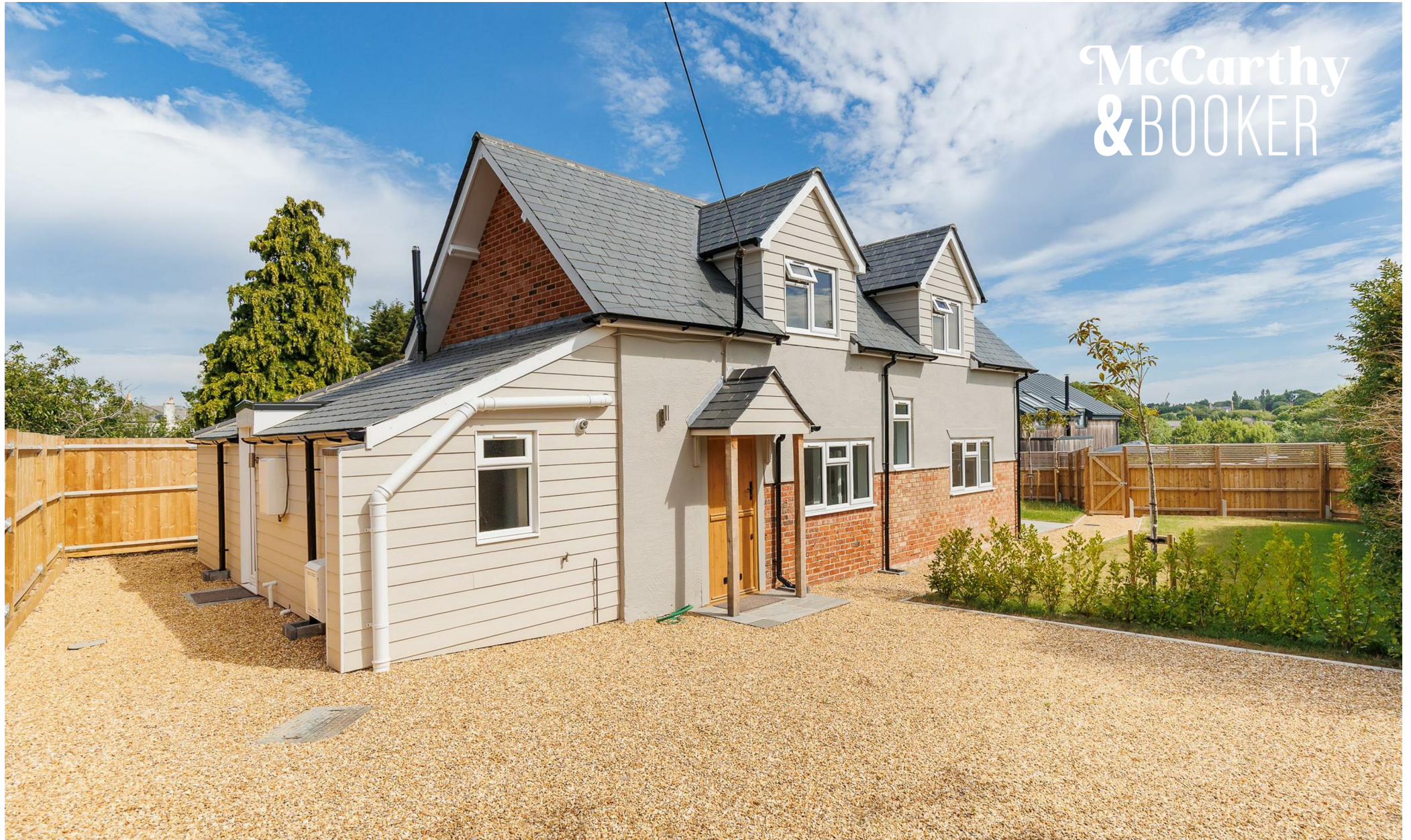
The Old Bakehouse Worsley Road, Gurnard, Isle of Wight, PO31 8JN