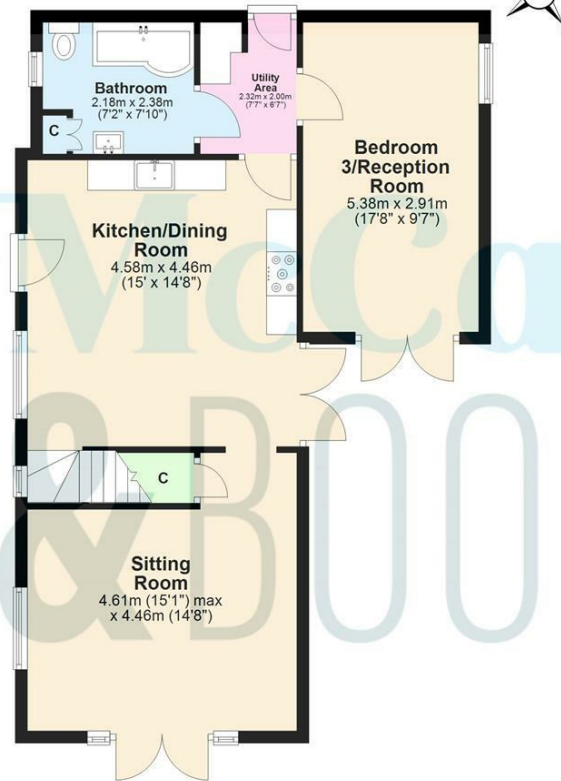
Ground Floor Approx. 68.4 sq. metres (736.5 sq. feet)